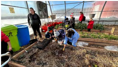
Spring seeds were planted at the greenhouse with the help of Chais Youth